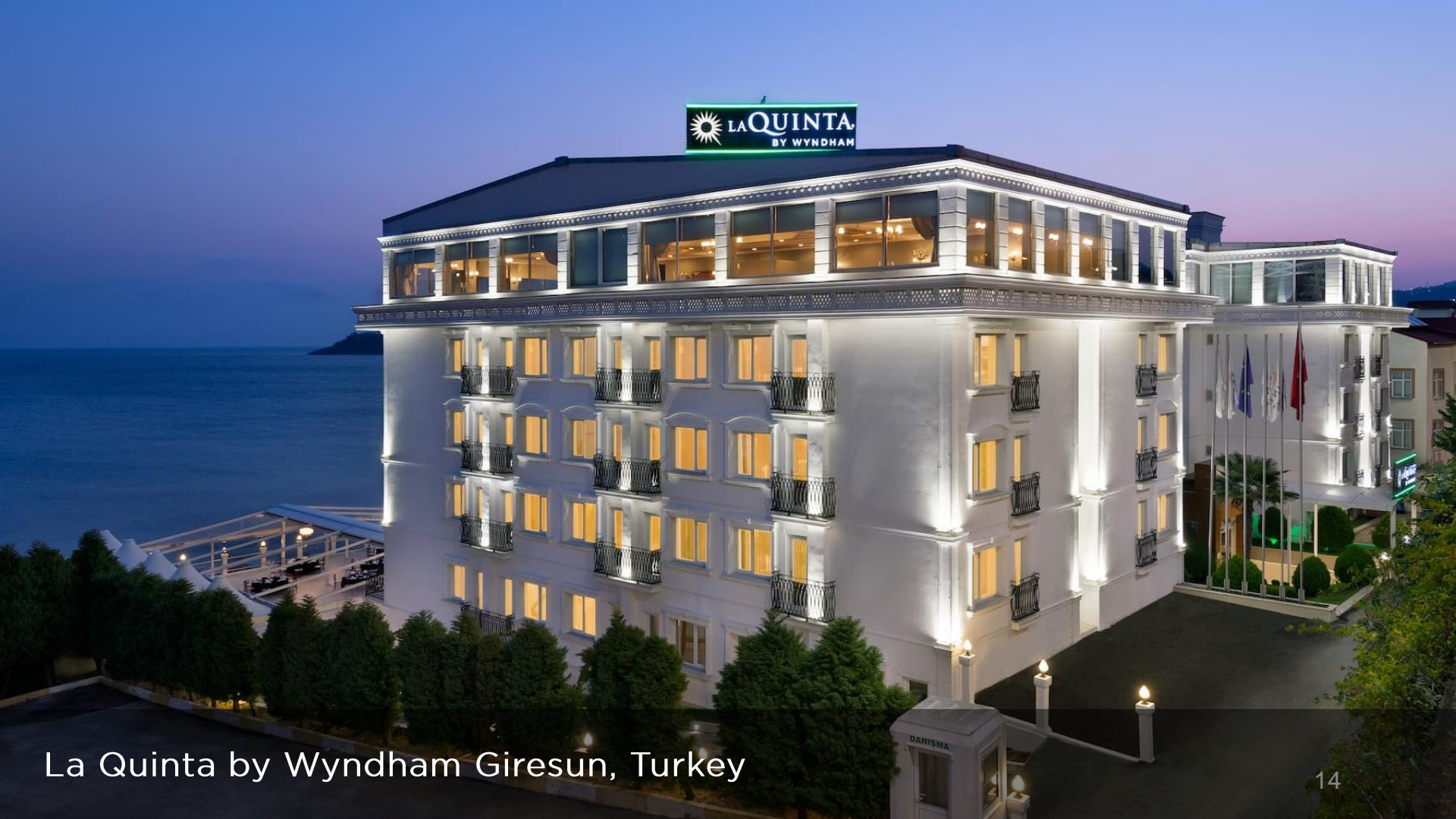
La Quinta by Wyndham Giresun, Turkey