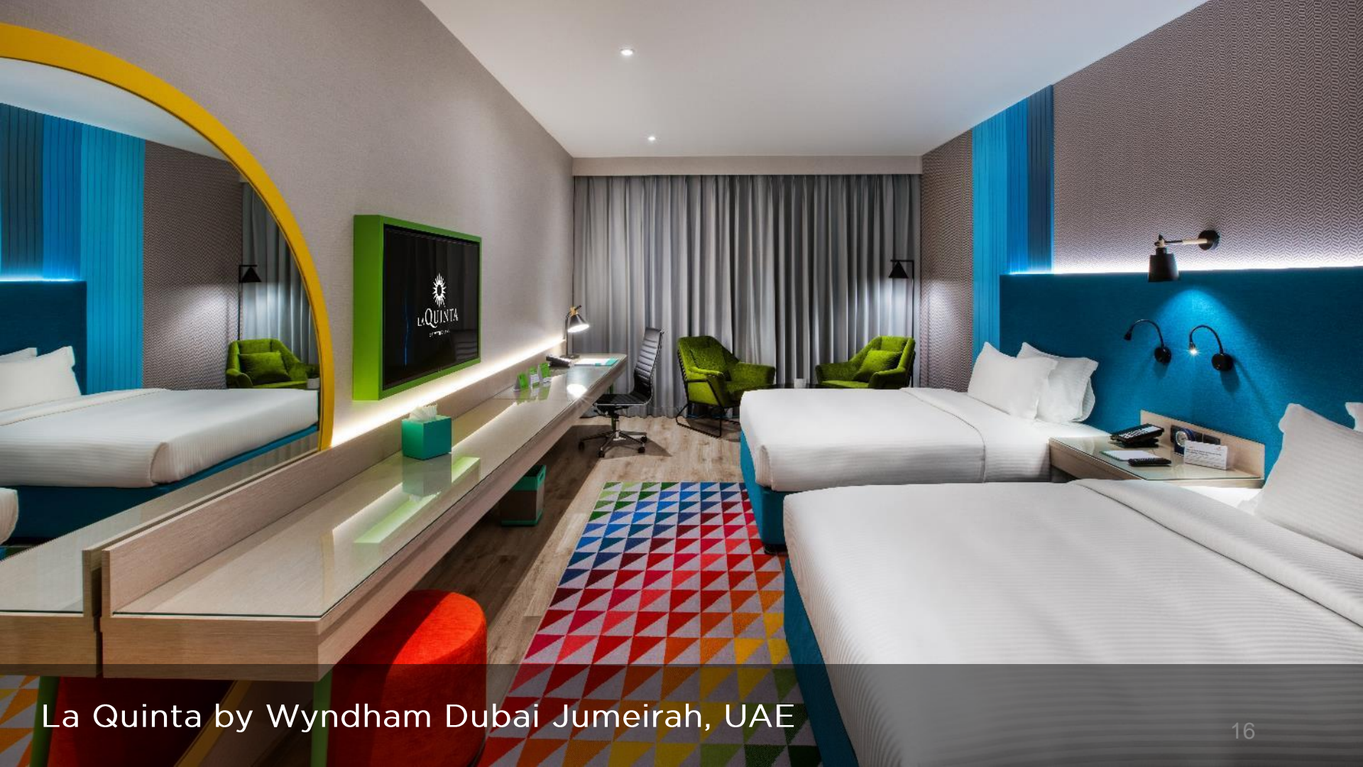
La Quinta by Wyndham Dubai Jumeirah, UAE