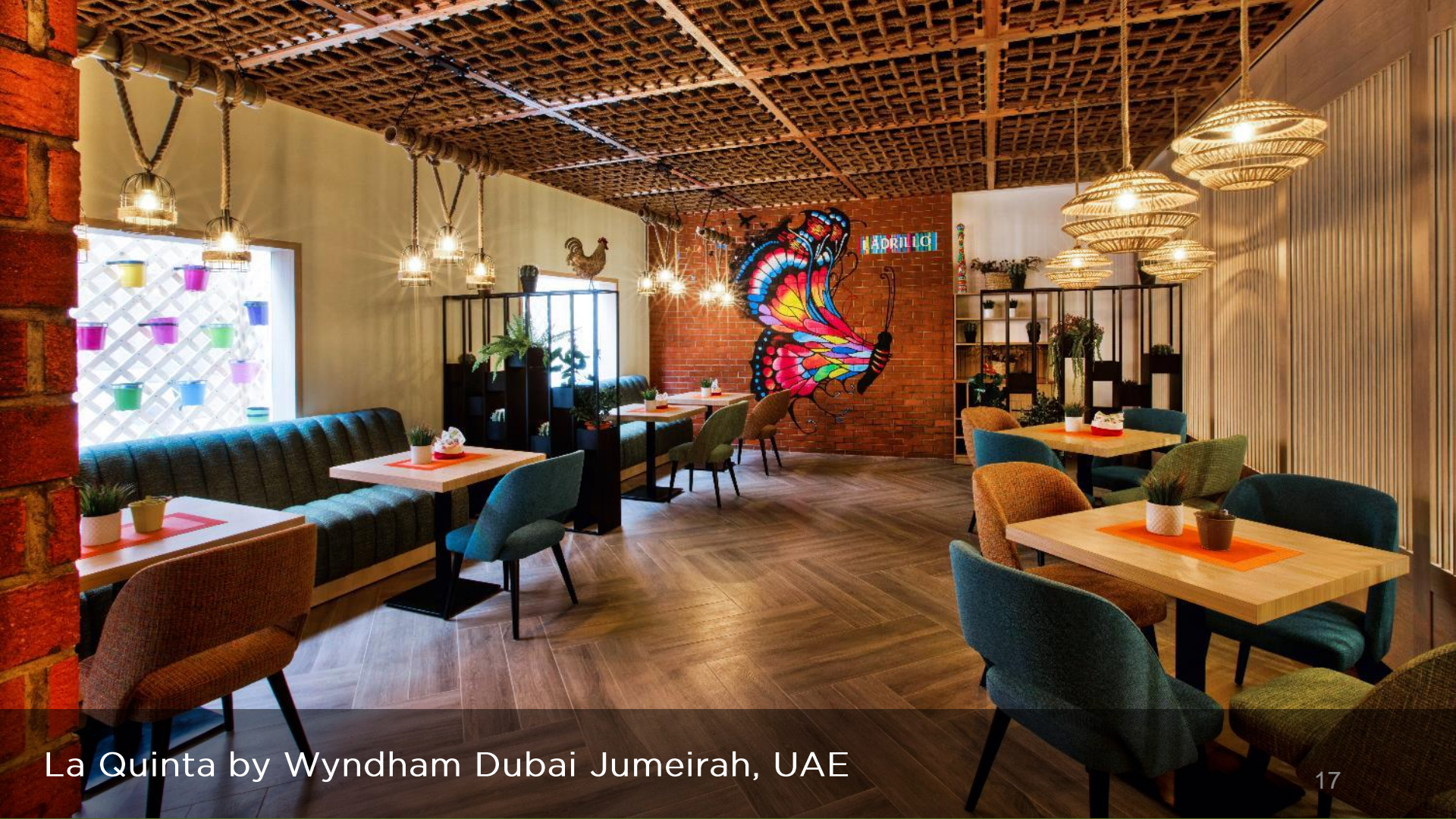
La Quinta by Wyndham Dubai Jumeirah, UAE