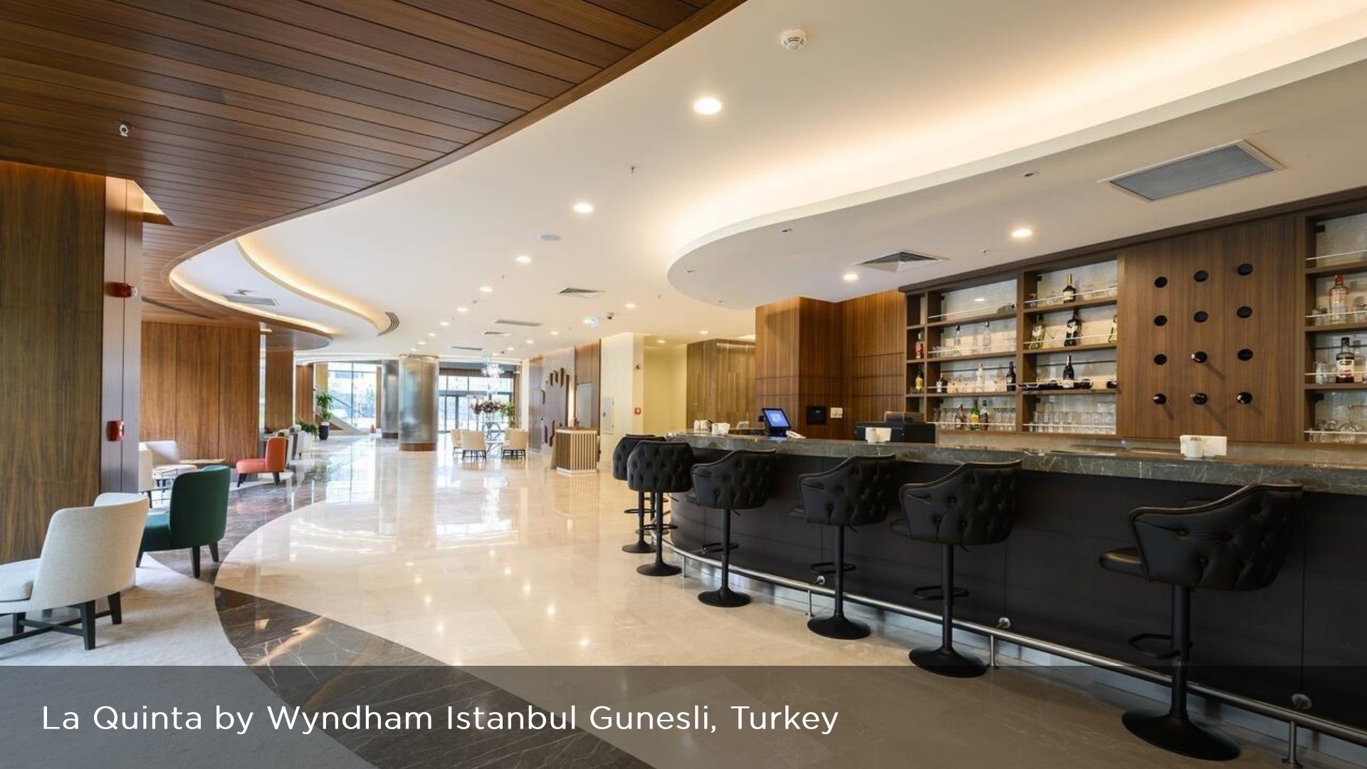
La Quinta by Wyndham Istanbul Gunesli, Turkey