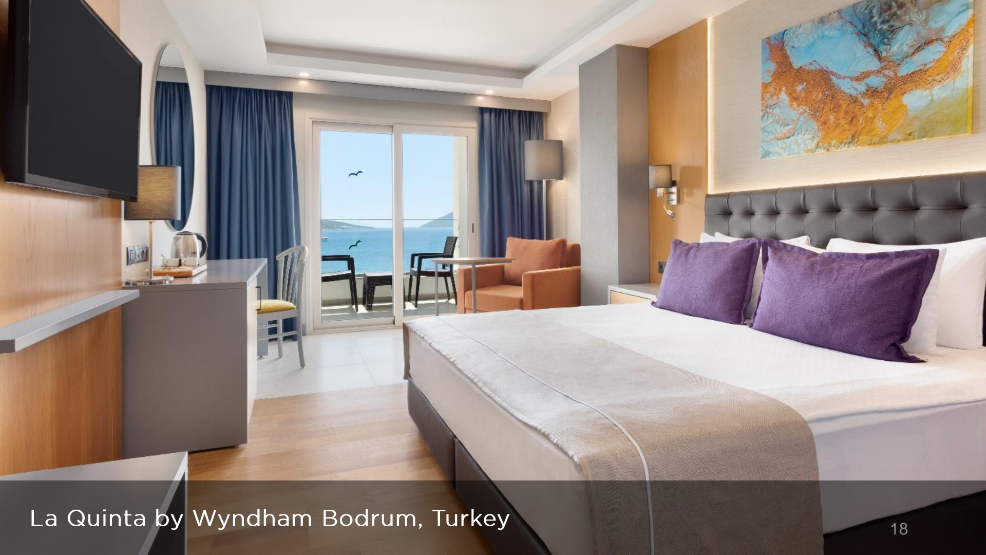
La Quinta by Wyndham Bodrum, Turkey