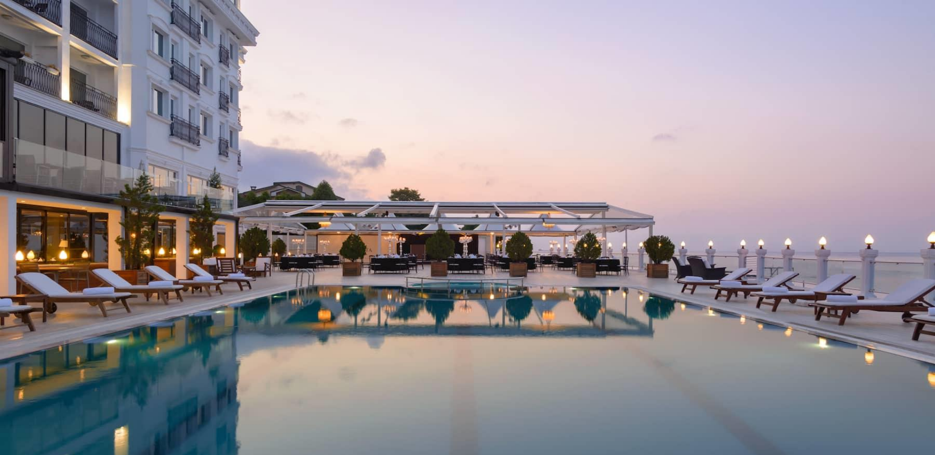
La Quinta by Wyndham Giresun, Turkey